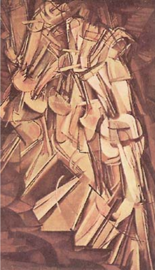
Plate 1 Marcel Duchamp, Nude Descending a Staircase No. 2 , 1912, oil on canvas, 146 x 89 cm.

In the case of paintings the plate number should be followed by the artist's name, the title of the picture (in italics or underlined), the date attributed to it, its medium and finally its dimensions. See the example below: