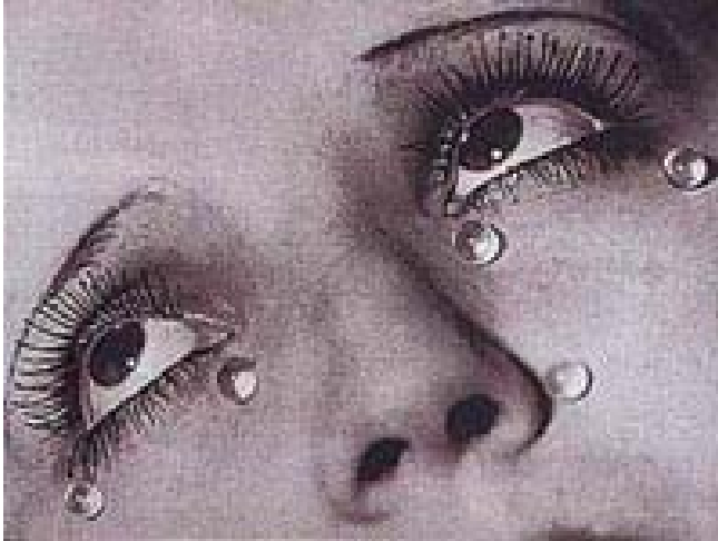
Plate 2 Man Ray, Larmes, c. 1930, silver print

In the case of a sculpture the plate number should be followed by the artist's name, the title of the sculpture (in italics or underlined), the date attributed to it, its medium and finally its dimensions. See the next example: